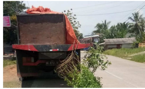
Figure 2. Position of Parked Heavy Vehicles.

The reality in the field is that accidents that occur due to unclear installation of triangles still occur frequently. The installation was not effective in terms of providing understanding or awareness to vehicle owners regarding the use of the safety triangle and the distance between the safety triangle and the vehicle [22].